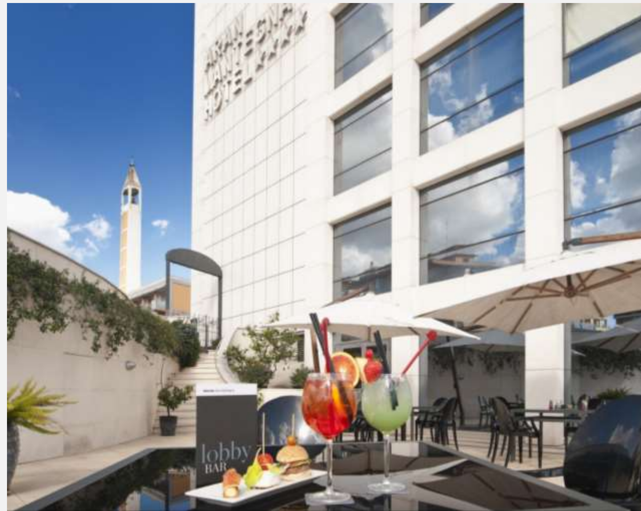
Barceló Aran Mantegna